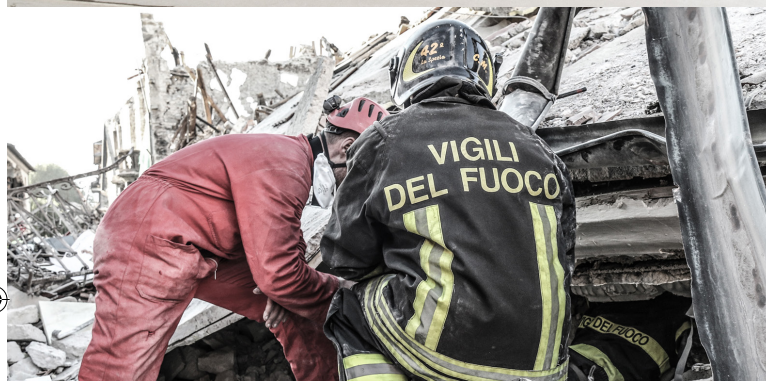
Earthquake and cascading failures Demonstration, 2020

Table top and computer assisted exercise, 2019