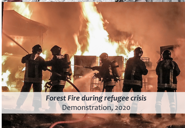
Forest Fire during refugee crisis Demonstration, 2020